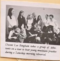
Debut Las Bingham takes a group of debutantes on a tour to four young musicians practice during a Saturday morning rehearsal.